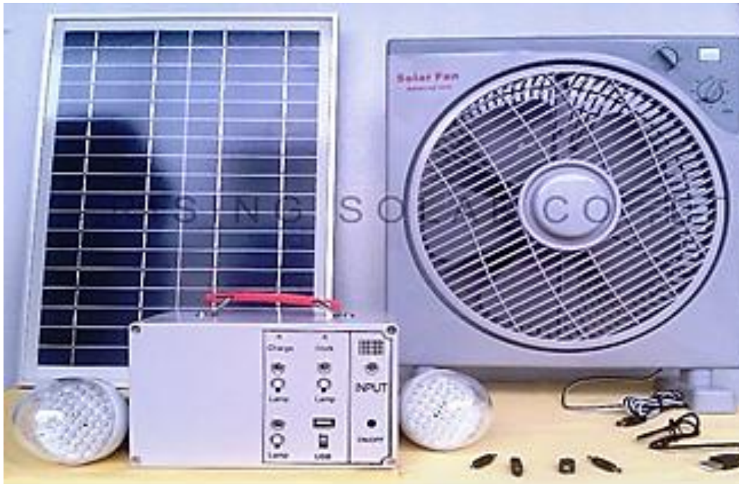
RS-SYS12-7 with 2 X 3 W LED lights bulbs and one 10W solar Fan model RDM 10 and mobile charging kit with 18W solar panel